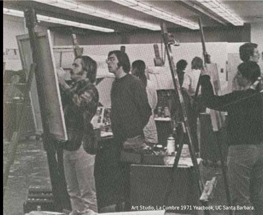
Art Studio, La Cumbre 1971 Yearbook, UC Santa Barbara.